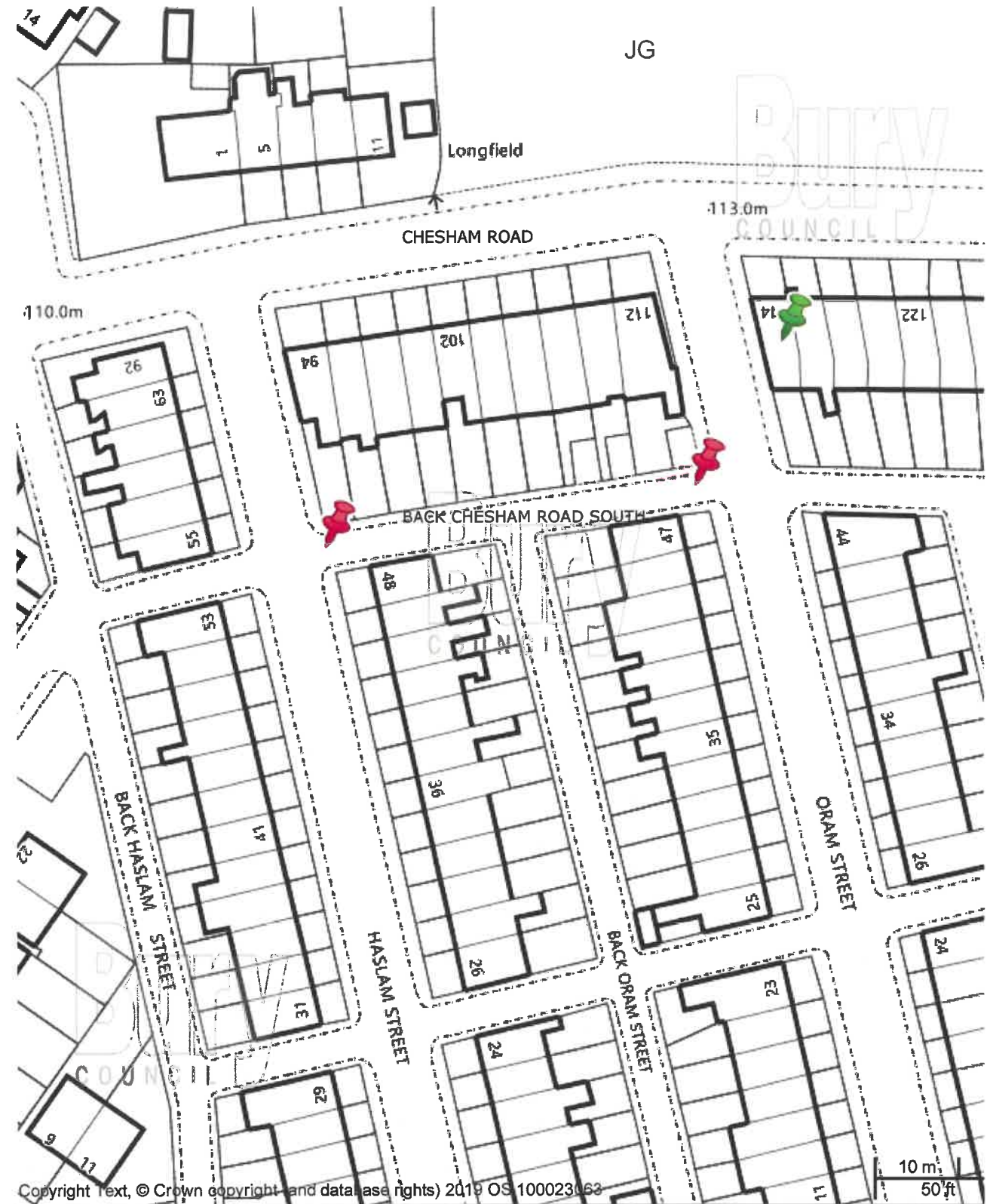
BACK CHESHAM ROAD SOUTH, BURY - TEMPORARY CLOSURE PLAN